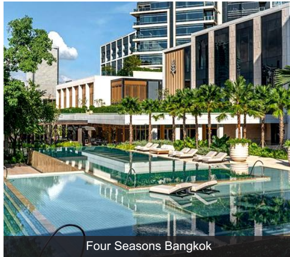
Four Seasons Bangkok