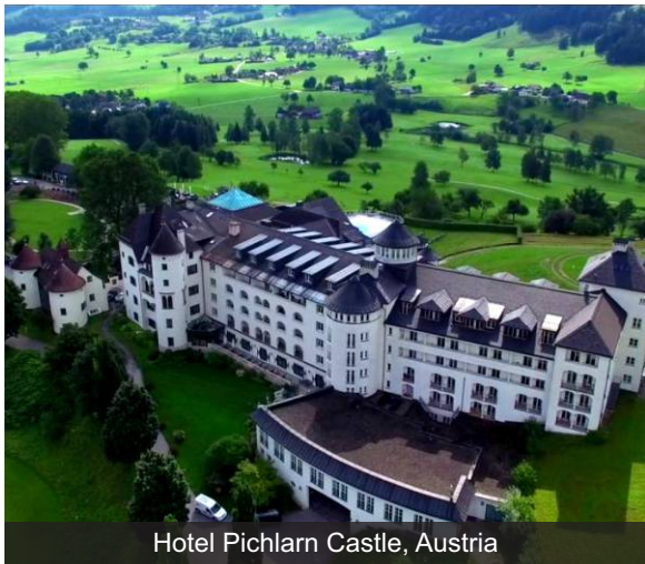
Hotel Pichlarn Castle, Austria