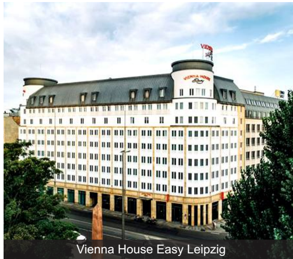
Vienna House Easy Leipzig