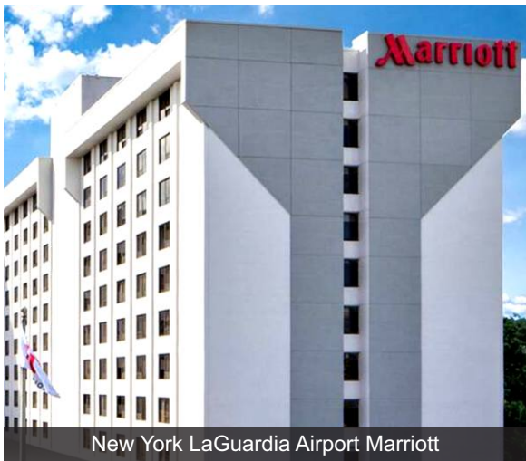
New York LaGuardia Airport Marriott