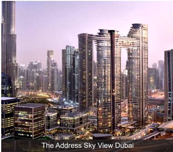
The Address Sky View Dubai